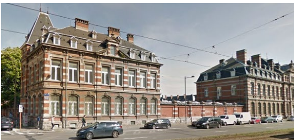
Figure 1 BrIAS building at USquare Campus.

Follow us on LinkedIn , Facebook , Youtube , and our website ( https://brias.be/ ) for more information about BrIAS, our mission statement and vision, and our upcoming events!